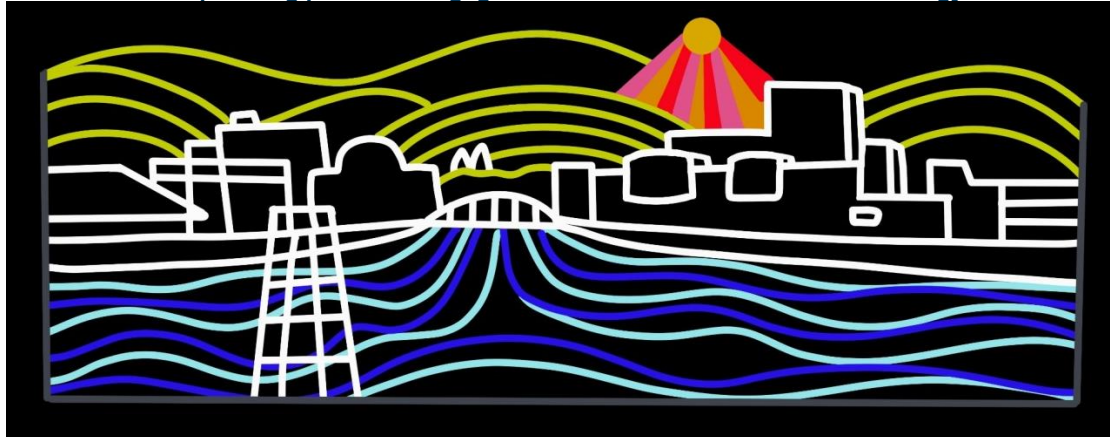
A sketch of the upcoming public art engagement for Eau Claire's Renewable Energy Action Plan