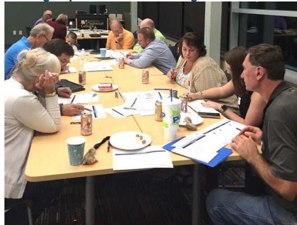
Focus groups discuss near term goals and metrics