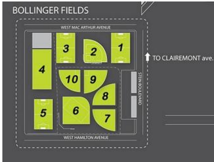
T-Ball & Baseball – Bollinger Fields - 3111 Eldorado Blvd, Eau Claire, WI 54701