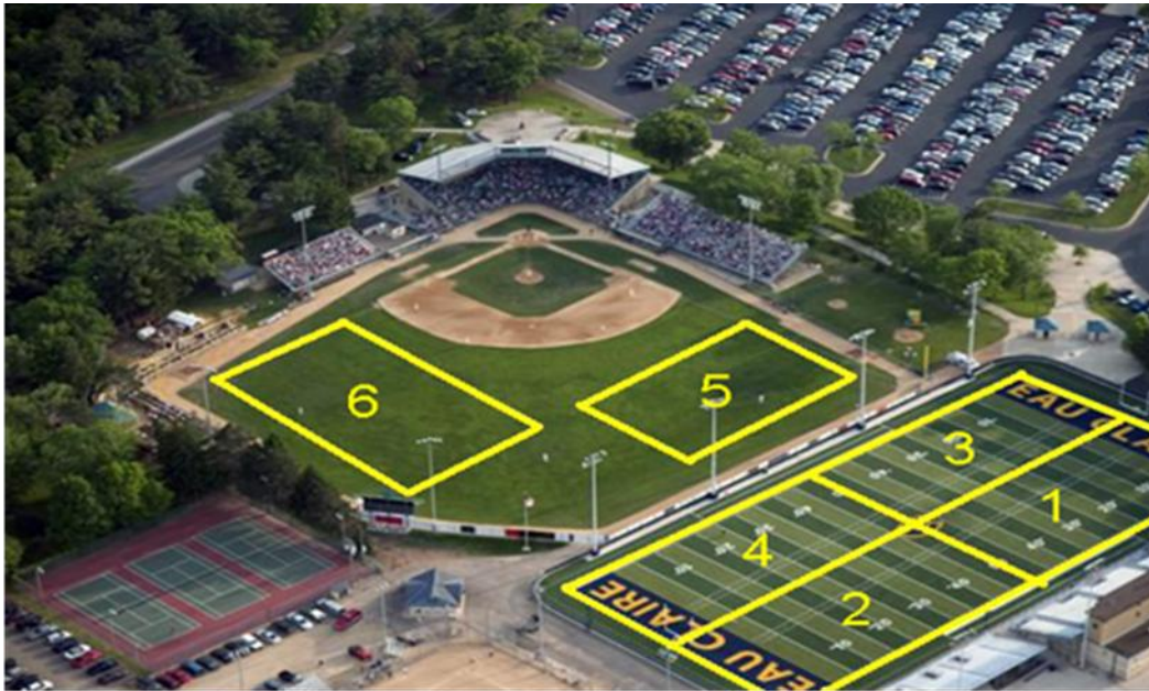
Flag Football – Carson Football Stadium - 100 Carson Park Dr, Eau Claire, WI 54703